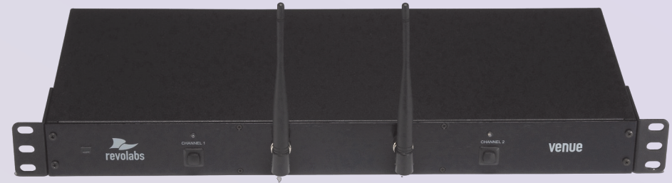
Rack-mountable HD Venue Base Station with 2 Diversity Antenna (shown attached)

NOTE: Revolabs Wireless Microphones Ship in Separate Boxes